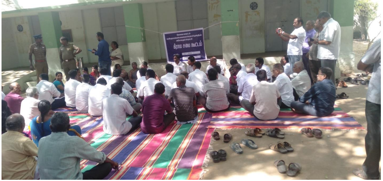
Chinniyam palayam Panchayat