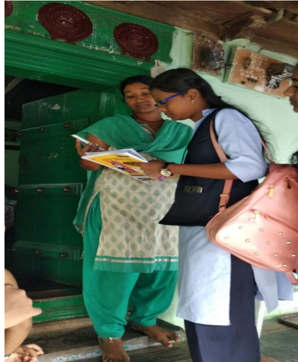
Photo graphs of Household survey at Chinniyam palayam, Neelambur and Vilankurichi villages