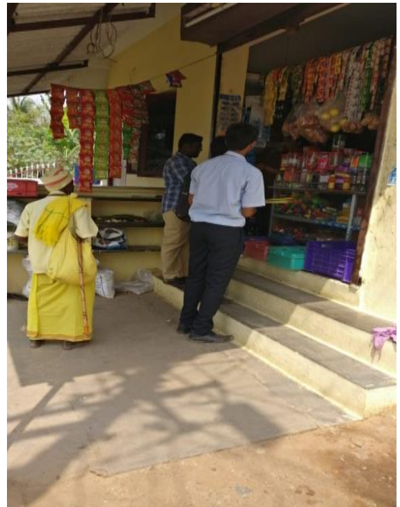
Photo graphs of Household Survey at Kurudampalayam and Ashokapuram Villages.