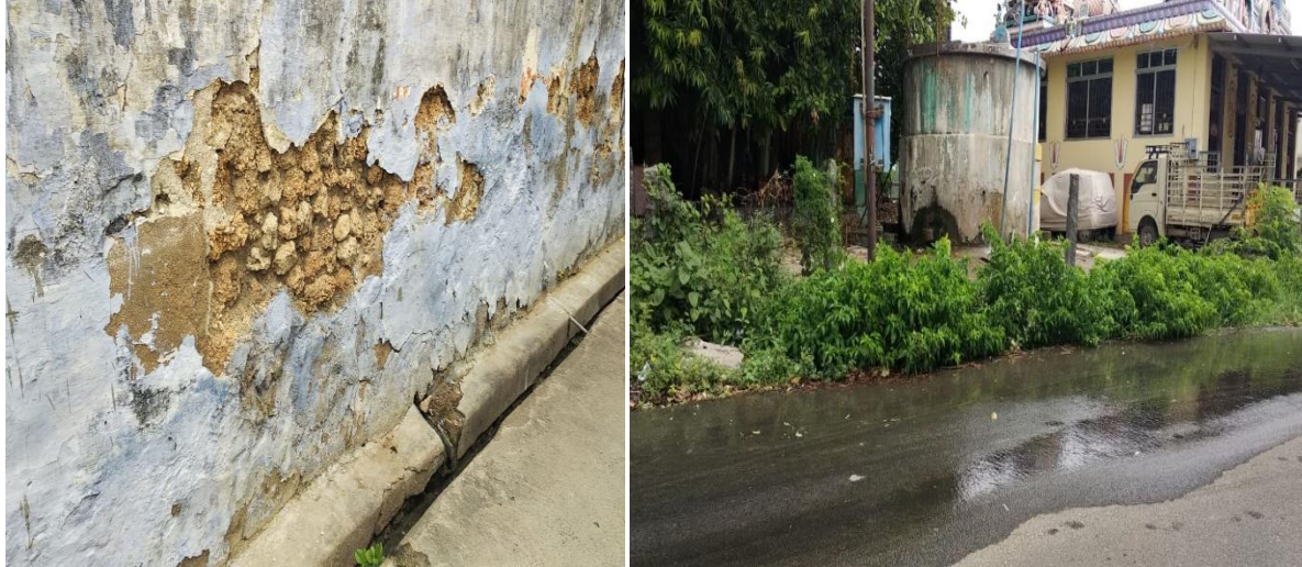
Photo graphs of Municipal waste at the adopted villages.